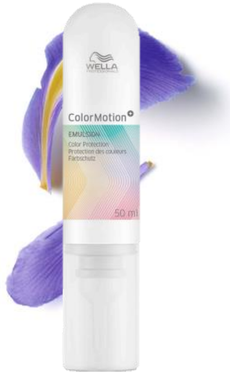
PETALE DE SOIE